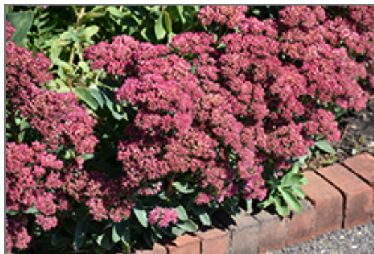
Carl Stonecrop in bloom

Carl Stonecrop is a dense herbaceous perennial with an upright spreading habit of growth. Its medium texture blends into the garden, but can always be balanced by a couple of finer or coarser plants for an effective composition.