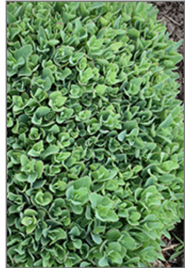
Carl Stonecrop foliage

Carl Stonecrop is a fine choice for the garden, but it is also a good selection for planting in outdoor pots and containers. It is often used as a 'filler' in the 'spiller-thriller-filler' container combination, providing a mass of flowers and foliage against which the larger thriller plants stand out. Note that when growing plants in outdoor containers and baskets, they may require more frequent waterings than they would in the yard or garden.