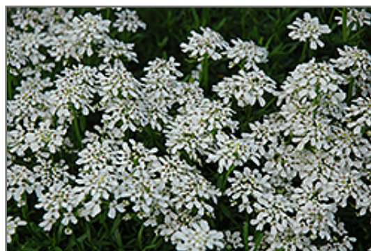
Little Gem Candytuft flowers