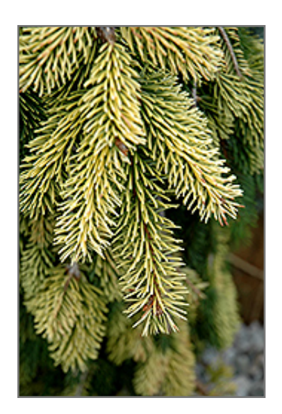
Gold Drift Norway Spruce foliage