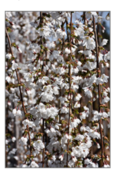
Snow Fountains Yoshino Cherry flowers