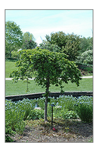
Snow Fountains Yoshino Cherry

This tree should only be grown in full sunlight. It does best in average to evenly moist conditions, but will not tolerate standing water. It is not particular as to soil pH, but grows best in rich soils. It is highly tolerant of urban pollution and will even thrive in inner city environments, and will benefit from being planted in a relatively sheltered location. This particular variety is an interspecific hybrid.