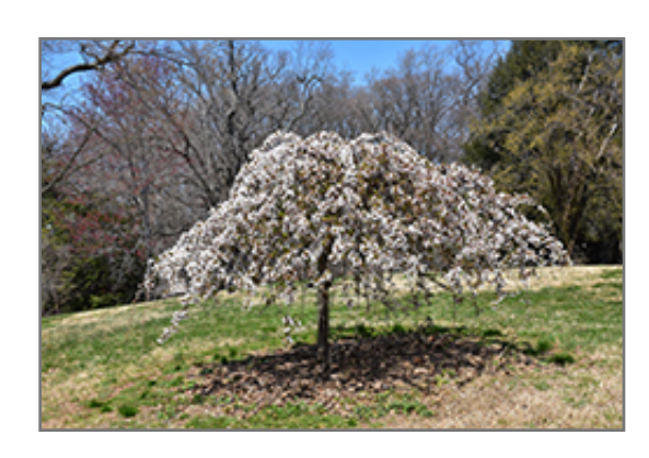
Snow Fountains Yoshino Cherry in bloom

Snow Fountains Yoshino Cherry is recommended for the following landscape applications;