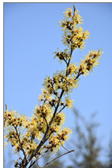
Arnold Promise Witchhazel flowers