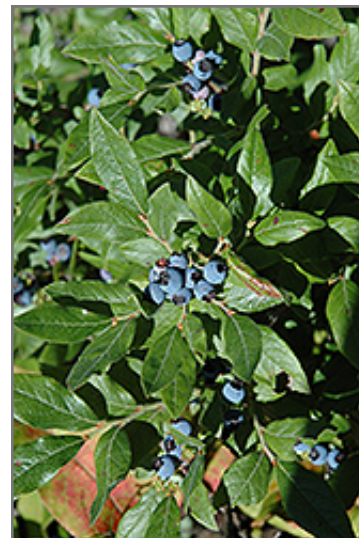
Lowbush Blueberry fruit

Lowbush Blueberry features dainty clusters of white bell-shaped flowers with shell pink overtones hanging below the branches in mid spring. It has dark green deciduous foliage. The oval leaves turn an outstanding scarlet in the fall. It features an abundance of magnificent blue berries in mid summer.