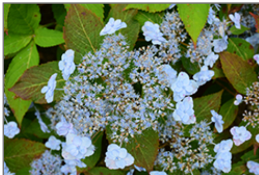
Tiny Tuff Stuff Hydrangea flowers