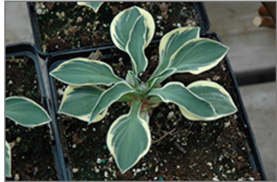
Funny Mouse Hosta foliage