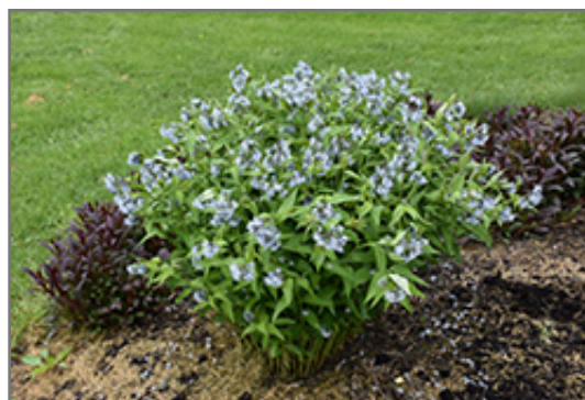
Blue Star Flower in bloom