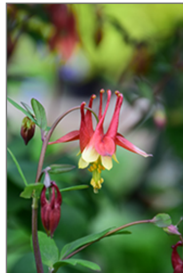
Wild Red Columbine flowers