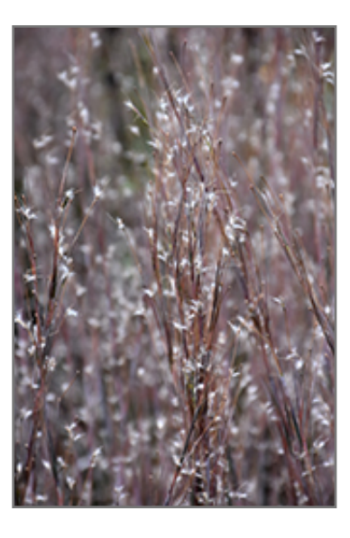
Standing Ovation Bluestem fruit

This plant should only be grown in full sunlight. It is very adaptable to both dry and moist locations, and should do just fine under typical garden conditions. It is considered to be drought-tolerant, and thus makes an ideal choice for a low-water garden or xeriscape application. It is not particular as to soil type or pH. It is somewhat tolerant of urban pollution. This is a selection of a native North American species. It can be propagated by division; however, as a cultivated variety, be aware that it may be subject to certain restrictions or prohibitions on propagation.