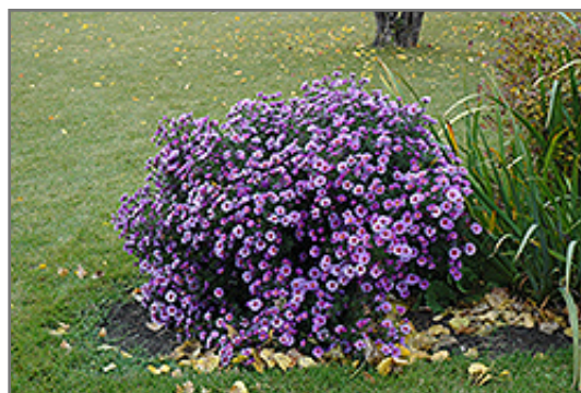
Purple Dome Aster in bloom