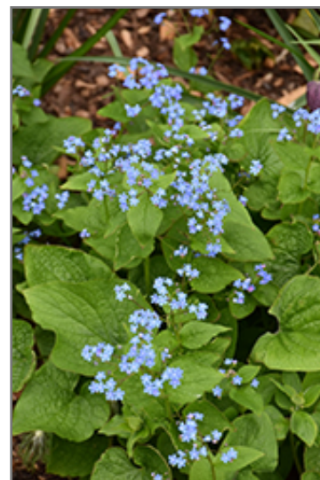
Siberian Bugloss flowers