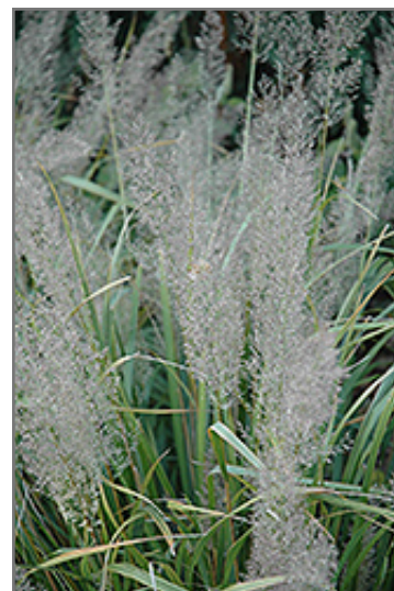
Korean Reed Grass fruit