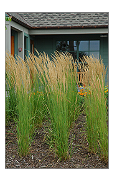
Karl Foerster Reed Grass

Karl Foerster Reed Grass is recommended for the following landscape applications;