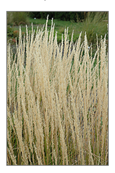
Karl Foerster Reed Grass flowers