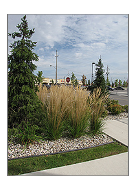
Karl Foerster Reed Grass in bloom

This plant does best in full sun to partial shade. It is very adaptable to both dry and moist locations, and should do just fine under typical garden conditions. It is not particular as to soil type or pH. It is highly tolerant of urban pollution and will even thrive in inner city environments. This particular variety is an interspecific hybrid. It can be propagated by division; however, as a cultivated variety, be aware that it may be subject to certain restrictions or prohibitions on propagation.