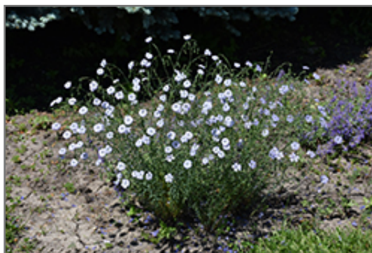
Blue Sapphire Perennial Flax in bloom

Blue Sapphire Perennial Flax is recommended for the following landscape applications;