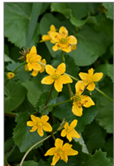
Marsh Marigold flowers