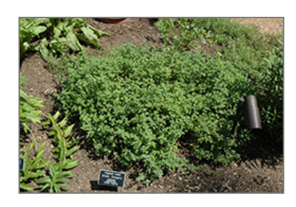
Greek Oregano

This is an herbaceous evergreen perennial herb with a mounded form. It brings an extremely fine and delicate texture to the garden composition and should be used to full effect. This is a relatively low maintenance plant, and should be cut back in late fall in preparation for winter. It is a good choice for attracting bees and butterflies to your yard, but is not particularly attractive to deer who tend to leave it alone in favor of tastier treats. It has no significant negative characteristics.