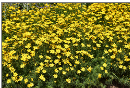
Golden Showers Tickseed in bloom