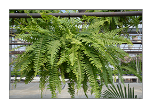
Boston Fern

When grown indoors, Boston Fern can be expected to grow to be about 24 inches tall at maturity, with a spread of 24 inches. It grows at a fast rate, and under ideal conditions can be expected to live for approximately 20 years. This houseplant performs well in both bright or indirect sunlight and strong artificial light, and can therefore be situated in almost any well-lit room or location. It does best in average to evenly moist soil, but will not tolerate standing water. The surface of the soil shouldn't be allowed to dry out completely, and so you should expect to water this plant once and possibly even twice each week. Be aware that your particular watering schedule may vary depending on its location in the room, the pot size, plant size and other conditions; if in doubt, ask one of our experts in the store for advice. It is not particular as to soil pH, but grows best in rich soil. Contact the store for specific recommendations on pre-mixed potting soil for this plant.