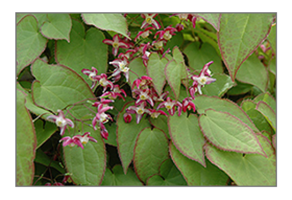
Bishop's Hat flowers

Bishop's Hat is a dense herbaceous evergreen perennial with a ground-hugging habit of growth. Its relatively fine texture sets it apart from other garden plants with less refined foliage.