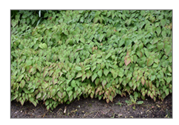
Bishop's Hat

Bishop's Hat is a fine choice for the garden, but it is also a good selection for planting in outdoor pots and containers. Because of its spreading habit of growth, it is ideally suited for use as a 'spiller' in the 'spiller-thriller-filler' container combination; plant it near the edges where it can spill gracefully over the pot. Note that when growing plants in outdoor containers and baskets, they may require more frequent waterings than they would in the yard or garden.