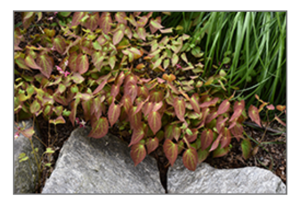
Bishop's Hat