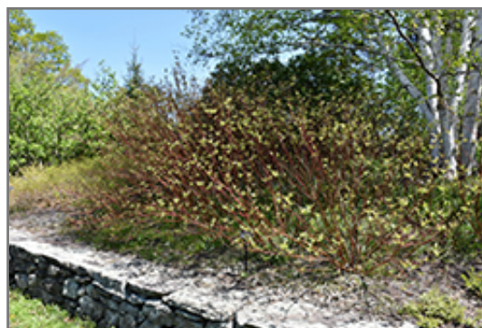
Bailey's Red Twig Dogwood in spring