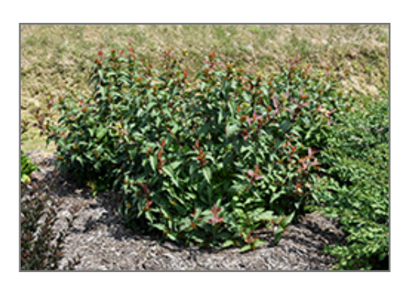
Kodiak Red Diervilla

Kodiak Red Diervilla is a dense multi-stemmed deciduous shrub with a mounded form. Its average texture blends into the landscape, but can be balanced by one or two finer or coarser trees or shrubs for an effective composition.