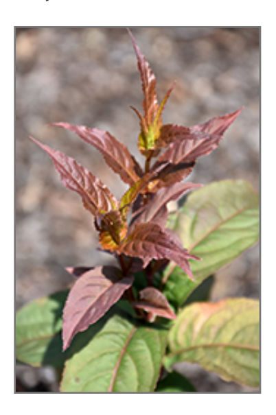
Kodiak Red Diervilla foliage