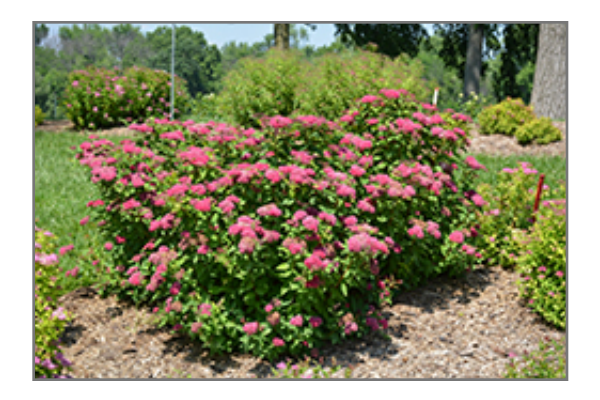
Double Play Red Spirea in bloom