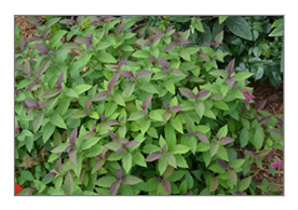
Double Play Red Spirea

Double Play Red Spirea will grow to be about 3 feet tall at maturity, with a spread of 3 feet. It tends to fill out right to the ground and therefore doesn't necessarily require facer plants in front. It grows at a fast rate, and under ideal conditions can be expected to live for approximately 20 years.