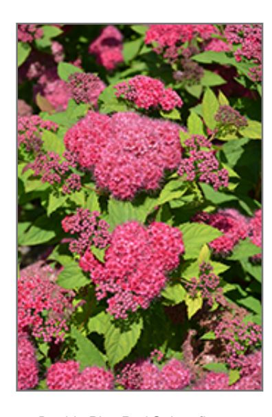
Double Play Red Spirea flowers

This shrub will require occasional maintenance and upkeep, and is best pruned in late winter once the threat of extreme cold has passed. It is a good choice for attracting butterflies to your yard, but is not particularly attractive to deer who tend to leave it alone in favor of tastier treats. It has no significant negative characteristics.