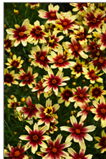
Satin & Lace Red Chiffon Tickseed flowers