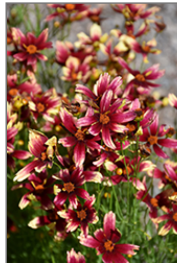
Satin & Lace Red Chiffon Tickseed flowers

Satin & Lace Red Chiffon Tickseed is a fine choice for the garden, but it is also a good selection for planting in outdoor pots and containers. It is often used as a 'filler' in the 'spiller-thriller-filler' container combination, providing a mass of flowers against which the thriller plants stand out. Note that when growing plants in outdoor containers and baskets, they may require more frequent waterings than they would in the yard or garden.