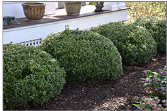
Sprinter Boxwood

Sprinter Boxwood makes a fine choice for the outdoor landscape, but it is also well-suited for use in outdoor pots and containers. Because of its height, it is often used as a 'thriller' in the 'spiller-thriller-filler' container combination; plant it near the center of the pot, surrounded by smaller plants and those that spill over the edges. It is even sizeable enough that it can be grown alone in a suitable container. Note that when grown in a container, it may not perform exactly as indicated on the tag - this is to be expected. Also note that when growing plants in outdoor containers and baskets, they may require more frequent waterings than they would in the yard or garden.