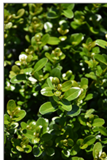
Sprinter Boxwood foliage