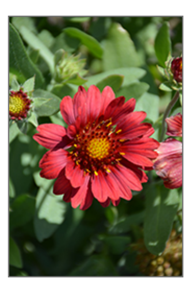
Mesa Red Blanket Flower flowers

Mesa Red Blanket Flower is recommended for the following landscape applications;