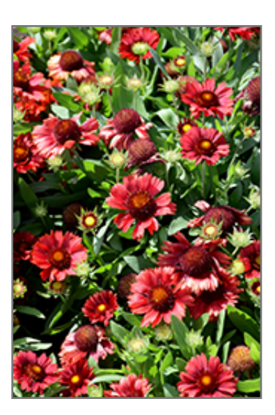
Mesa Red Blanket Flower flowers