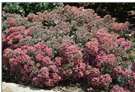
Popstar Stonecrop in bloom