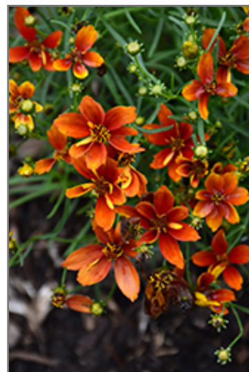
Sizzle And Spice Crazy Cayenne Tickseed flowers

Sizzle And Spice Crazy Cayenne Tickseed is recommended for the following landscape applications;