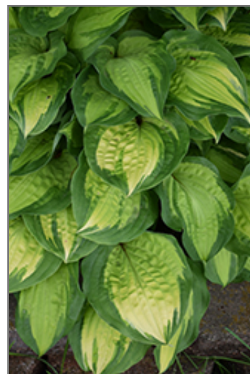
Island Breeze Hosta foliage