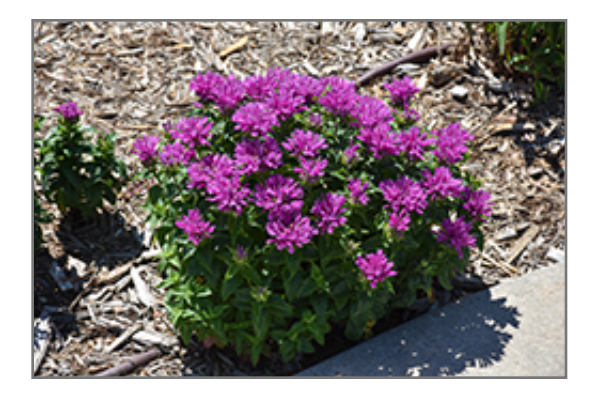
Leading Lady Plum Beebalm in bloom

This plant will require occasional maintenance and upkeep, and should be cut back in late fall in preparation for winter. It is a good choice for attracting bees, butterflies and hummingbirds to your yard, but is not particularly attractive to deer who tend to leave it alone in favor of tastier treats. Gardeners should be aware of the following characteristic(s) that may warrant special consideration;