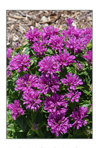
Leading Lady Plum Beebalm flowers

Leading Lady Plum Beebalm is an herbaceous perennial with a mounded form. Its medium texture blends into the garden, but can always be balanced by a couple of finer or coarser plants for an effective composition.