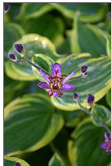
Autumn Glow Toad Lily flowers