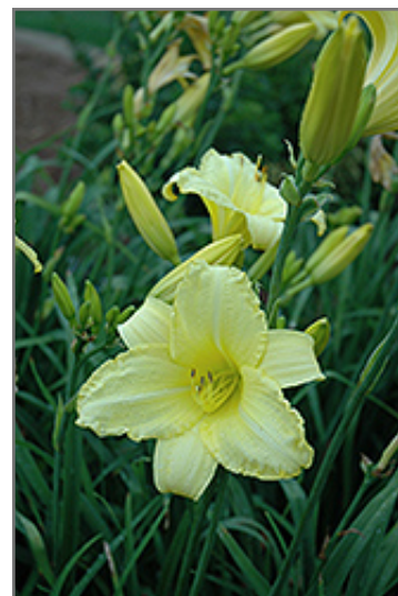
Happy Ever Appster Happy Returns Daylily flowers

Happy Ever Appster Happy Returns Daylily is recommended for the following landscape applications;