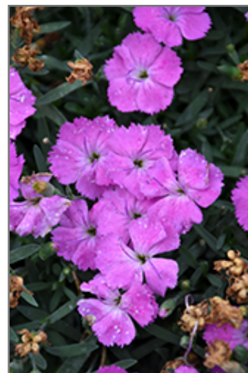
Paint The Town Fuchsia Pinks flowers

Paint The Town Fuchsia Pinks is an herbaceous evergreen perennial with a mounded form. It brings an extremely fine and delicate texture to the garden composition and should be used to full effect.