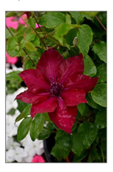
Boulevard Nubia Clematis flowers

Boulevard Nubia Clematis is recommended for the following landscape applications;