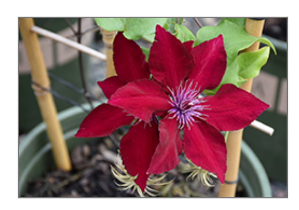
Boulevard Nubia Clematis flowers

This is a relatively low maintenance woody vine. It is a Type 3 clematis; each spring it should be pruned back to within a few inches of the ground, as it flowers on new wood of the season. It is a good choice for attracting hummingbirds to your yard. It has no significant negative characteristics.