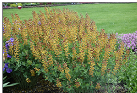
Decadence Cherries Jubilee False Indigo in bloom