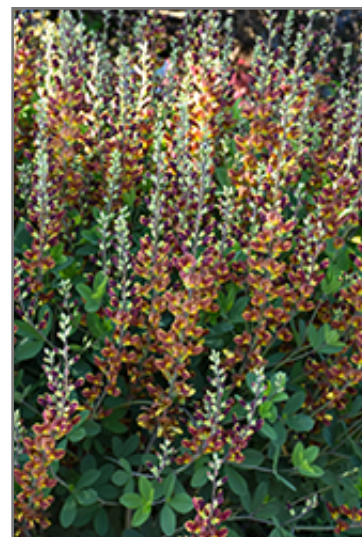
Decadence Cherries Jubilee False Indigo flowers

Decadence Cherries Jubilee False Indigo is a fine choice for the garden, but it is also a good selection for planting in outdoor pots and containers. With its upright habit of growth, it is best suited for use as a 'thriller' in the 'spiller-thriller-filler' container combination; plant it near the center of the pot, surrounded by smaller plants and those that spill over the edges. It is even sizeable enough that it can be grown alone in a suitable container. Note that when growing plants in outdoor containers and baskets, they may require more frequent waterings than they would in the yard or garden.