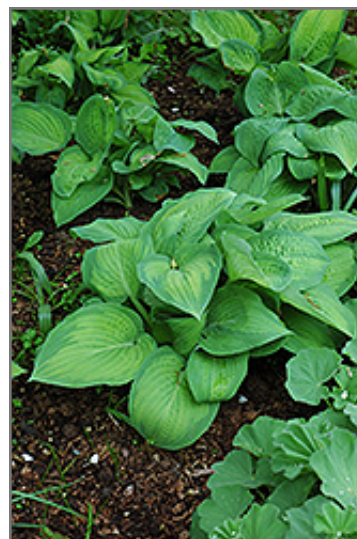
Paul's Glory Hosta