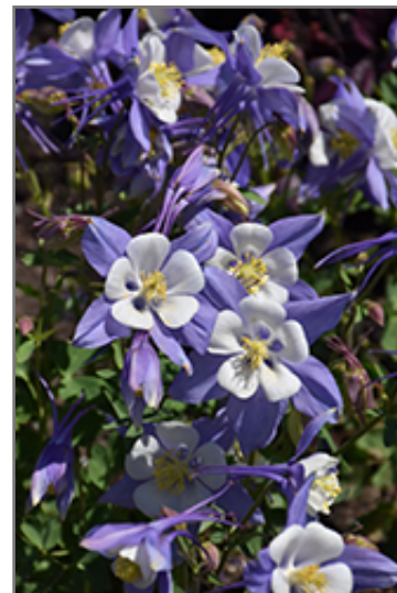
Songbird Blue Jay Columbine flowers

Songbird Blue Jay Columbine is an herbaceous perennial with an upright spreading habit of growth. Its medium texture blends into the garden, but can always be balanced by a couple of finer or coarser plants for an effective composition.