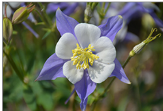
Songbird Blue Jay Columbine flowers