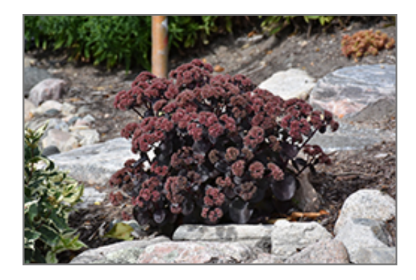
Night Embers Stonecrop in bloom

Night Embers Stonecrop is a dense herbaceous perennial with an upright spreading habit of growth. Its relatively coarse texture can be used to stand it apart from other garden plants with finer foliage.