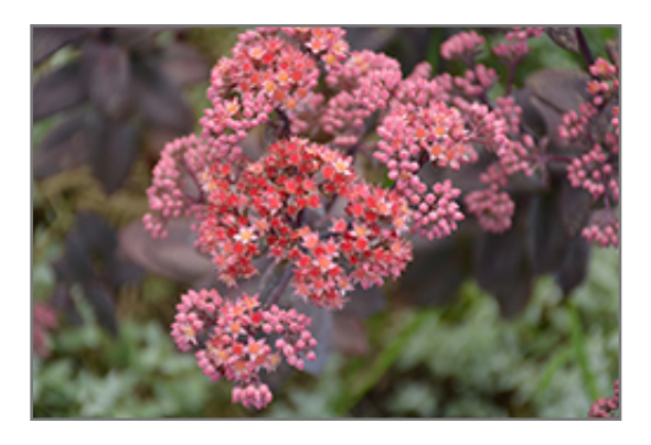
Night Embers Stonecrop flowers