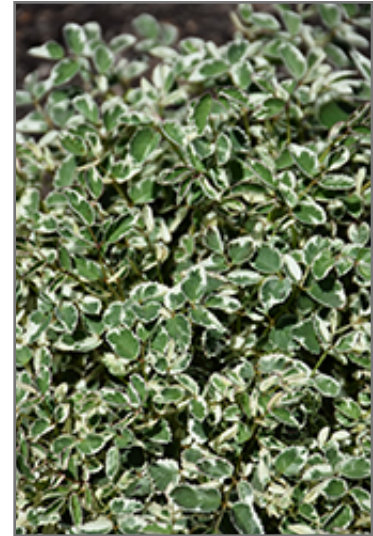
Little Angel Burnet flowers

Little Angel Burnet will grow to be only 4 inches tall at maturity extending to 10 inches tall with the flowers, with a spread of 14 inches. When grown in masses or used as a bedding plant, individual plants should be spaced approximately 12 inches apart. It grows at a medium rate, and under ideal conditions can be expected to live for approximately 15 years. As an herbaceous perennial, this plant will usually die back to the crown each winter, and will regrow from the base each spring. Be careful not to disturb the crown in late winter when it may not be readily seen!