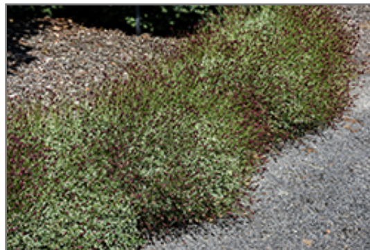
Little Angel Burnet in bloom