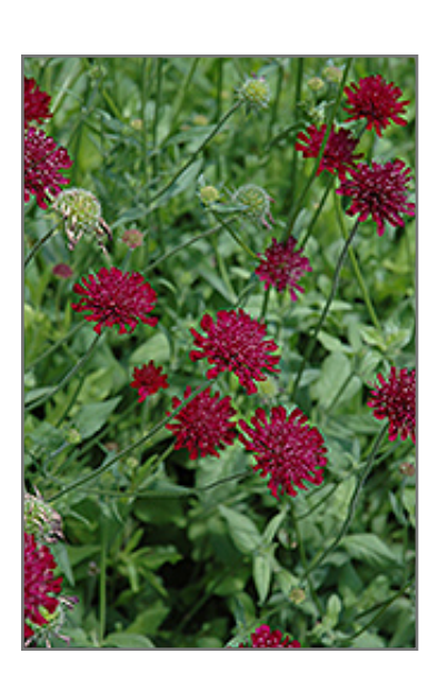
Crimson Scabious flowers

Crimson Scabious will grow to be about 24 inches tall at maturity extending to 3 feet tall with the flowers, with a spread of 24 inches. It tends to be leggy, with a typical clearance of 1 foot from the ground, and should be underplanted with lower-growing perennials. It grows at a fast rate, and under ideal conditions can be expected to live for approximately 3 years. As an herbaceous perennial, this plant will usually die back to the crown each winter, and will regrow from the base each spring. Be careful not to disturb the crown in late winter when it may not be readily seen!