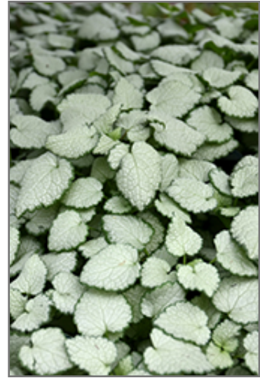
Red Nancy Spotted Dead Nettle foliage

Red Nancy Spotted Dead Nettle is a fine choice for the garden, but it is also a good selection for planting in outdoor pots and containers. Because of its spreading habit of growth, it is ideally suited for use as a 'spiller' in the 'spiller-thriller-filler' container combination; plant it near the edges where it can spill gracefully over the pot. Note that when growing plants in outdoor containers and baskets, they may require more frequent waterings than they would in the yard or garden.