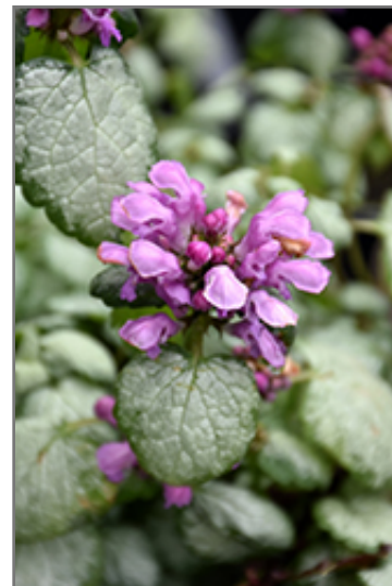
Red Nancy Spotted Dead Nettle flowers