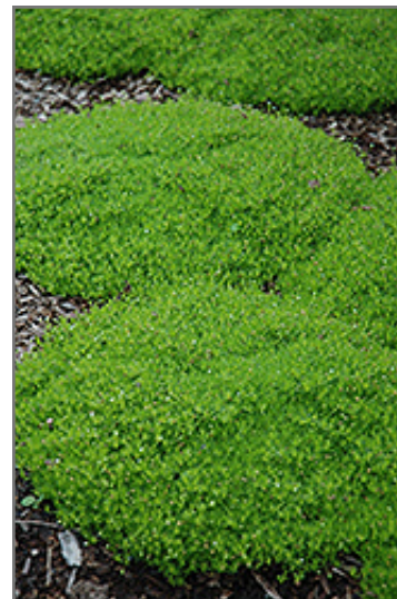
Irish Moss