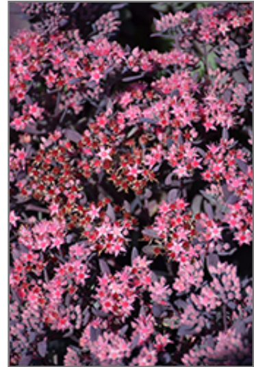
Plum Dazzled Stonecrop flowers

Plum Dazzled Stonecrop is a dense herbaceous perennial with an upright spreading habit of growth. Its medium texture blends into the garden, but can always be balanced by a couple of finer or coarser plants for an effective composition.