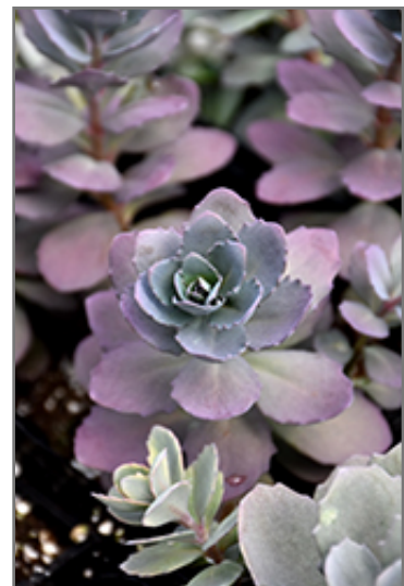
Plum Dazzled Stonecrop foliage