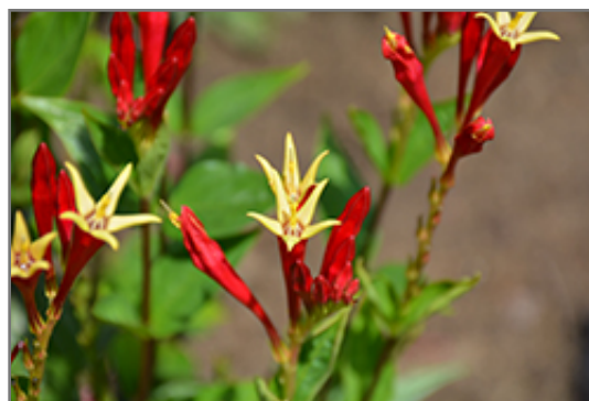
Little Redhead Indian Pink flowers