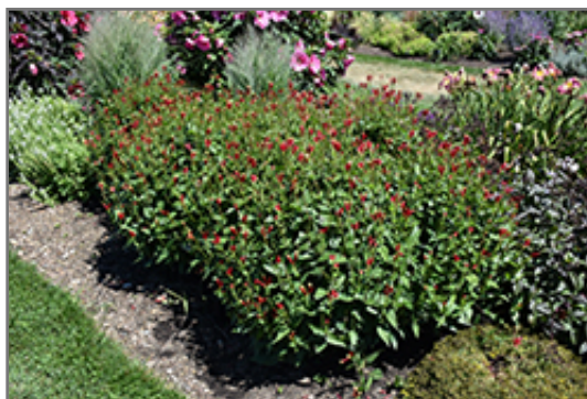
Little Redhead Indian Pink in bloom