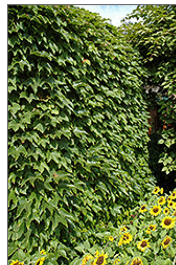
Boston Ivy