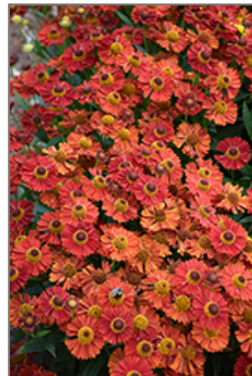
Mariachi Ranchera Sneezeweed flowers

Mariachi Ranchera Sneezeweed is an herbaceous perennial with an upright spreading habit of growth. Its medium texture blends into the garden, but can always be balanced by a couple of finer or coarser plants for an effective composition.