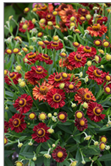
Mariachi Ranchera Sneezeweed flowers