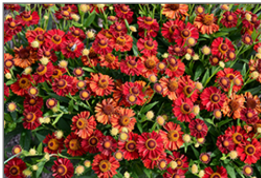
Mariachi Ranchera Sneezeweed flowers

Mariachi Ranchera Sneezeweed is a fine choice for the garden, but it is also a good selection for planting in outdoor pots and containers. With its upright habit of growth, it is best suited for use as a 'thriller' in the 'spiller-thriller-filler' container combination; plant it near the center of the pot, surrounded by smaller plants and those that spill over the edges. Note that when growing plants in outdoor containers and baskets, they may require more frequent waterings than they would in the yard or garden.