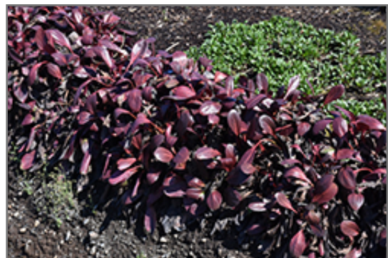
Flirt Bergenia foliage