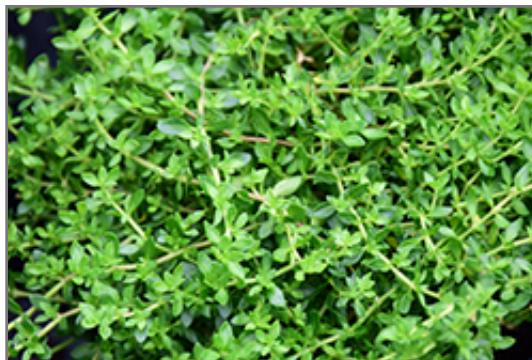
Rupturewort foliage

Rupturewort is recommended for the following landscape applications;