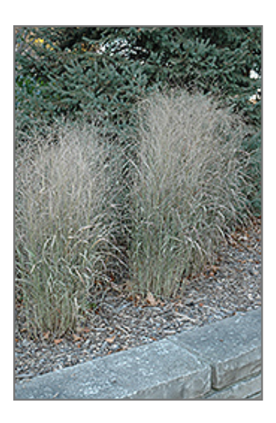
Shenandoah Reed Switch Grass in fall

This plant does best in full sun to partial shade. It is very adaptable to both dry and moist locations, and should do just fine under typical garden conditions. It is considered to be drought-tolerant, and thus makes an ideal choice for a low-water garden or xeriscape application. It is not particular as to soil type, but has a definite preference for alkaline soils, and is able to handle environmental salt. It is somewhat tolerant of urban pollution. This is a selection of a native North American species. It can be propagated by division; however, as a cultivated variety, be aware that it may be subject to certain restrictions or prohibitions on propagation.