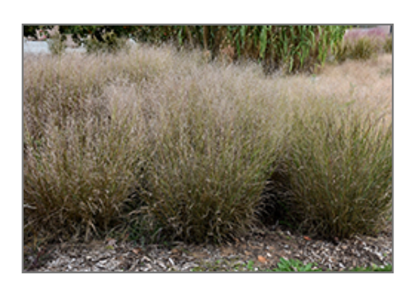
Shenandoah Reed Switch Grass fruit