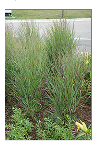
Shenandoah Reed Switch Grass